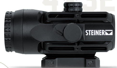
4X32 S432 SIGHT

OBJECTIVE LENS 32 MM | MAGNIFICATION 4X LENGTH 5.7 IN. | WEIGHT 25 OZ. BATTERY CR2032 / 3V ITEM NO. 8794 UPC 840229104451