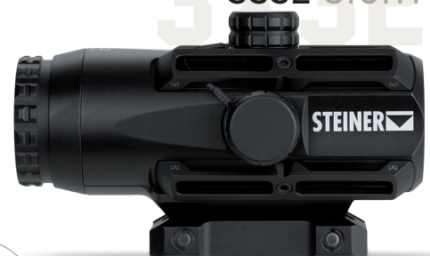
3X32 S332 SIGHT

OBJECTIVE LENS 32 MM | MAGNIFICATION 3X LENGTH 5.7 IN. | WEIGHT 21.6 OZ. BATTERY CR2032 / 3V ITEM NO. 8793 UPC 840229104444