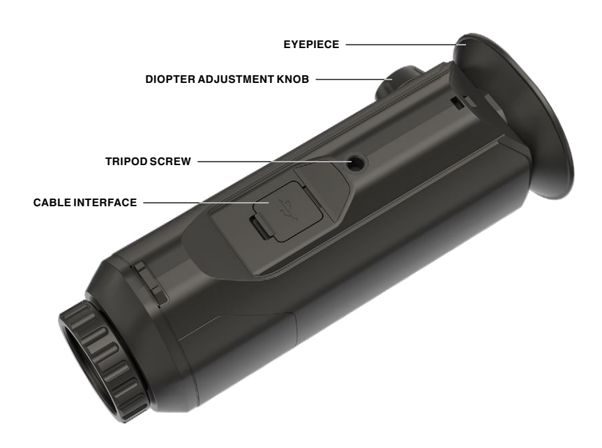
Overview of Interfaces