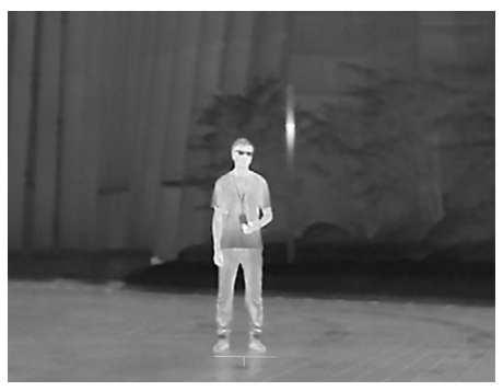
Set the Edge of Target Bottom

4. Align the center of bottom mark with the edge of target bottom. Press