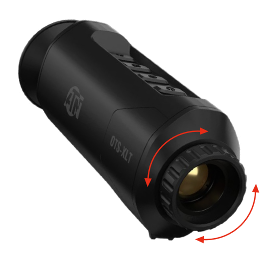
Adjust Objective Lens

Slightly rotate the focus wheel to focus the objective lens.