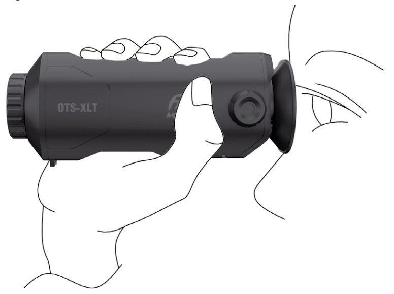
View the Target

When adjusting diopter, DO NOT touch the surface of lens to avoid smearing the lens.