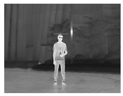
Set the Top Edge of the Target

The cursor blinks on the top edge of the target.