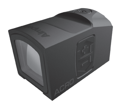
Acro P-1™ User manual