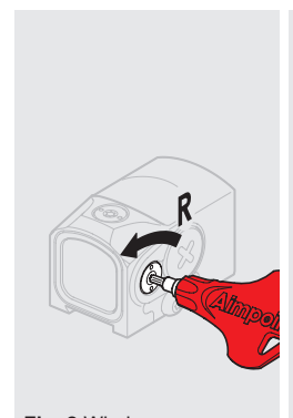
Fig. 2 Windage adjustments