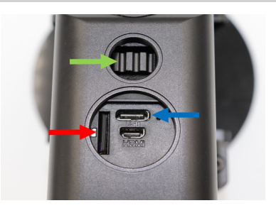
Green arrow - Focus Ring Blue arrow - Charge Port Red arrow - SD Card