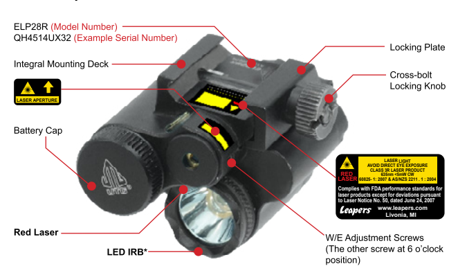
*IRB - Integrated Reflector and Bulb