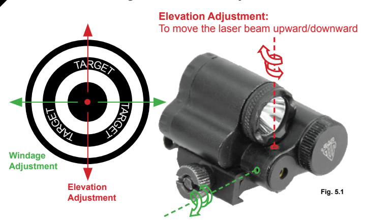
Windage Adjustment: To move the laser beam left/right