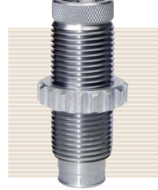
FACTORY CRIMP IS A TRADEMARK OF LEE PRECISION, INC

The Bullet Seating die is equipped with a floating bullet seating plug for maximum accuracy. It is designed to seat all shapes of bullets with minimum deformation. If you attempt to compress the charge, it may deform the bullet an objectionable amount. It will be necessary to modify the bullet seating punch to fit the bullet. If unable to do it yourself or have it done locally, we can do it for you. Send $14.00 along with a sample bullet, and order "Custom Seating Plug for Sample Bullet" ($8.00 for the bullet + $6.00 for shipping)